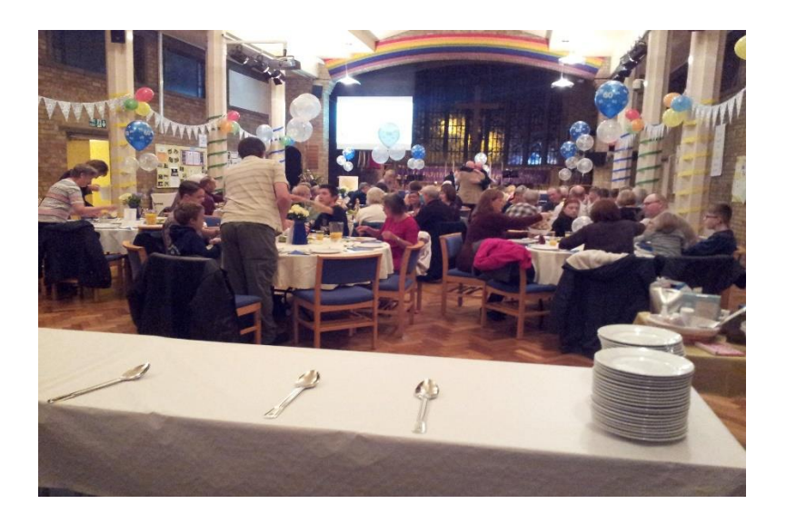
St. Peter's 60th Birthday Celebrations