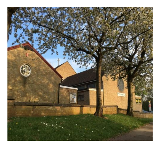
St Peter's Church